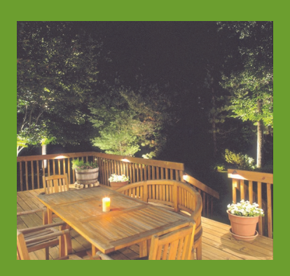
Call H&M Landscaping and ask about switching the bulbs in your landscape lighting system to LED today; which carries a minimum six year warranty.

5) Less Bugs – Mosquitoes and other flying insects are attracted to the ultraviolet and infrared colors in the light spectrum. Because LEDs contain neither of these, they will not attract those pests that can ruin a beautiful summer evening spent outdoors.